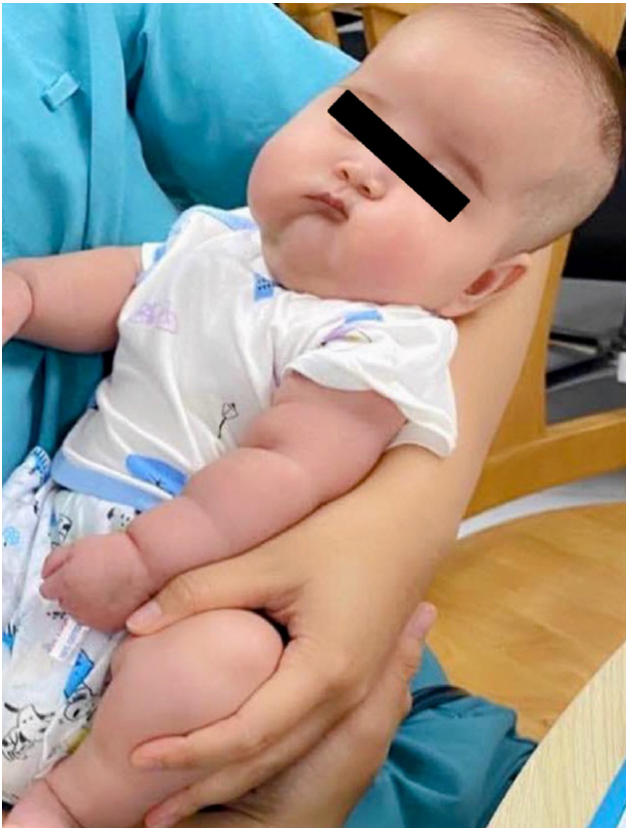
Fig. 2. The patient exhibited signs of Cushing syndrome one month after initiating treatment.

raised concerns about the initial diagnosis, prompting genetic testing for further evaluation.